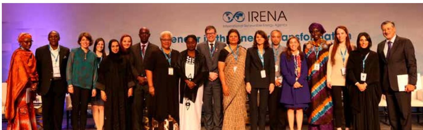
Panelists of the special event, “Gender in the Energy Transformation”

We call on IRENA to continue to inform evidence-based policy-making on the inclusion of women in the energy sector and to continue collaborating with other organisations and networks.