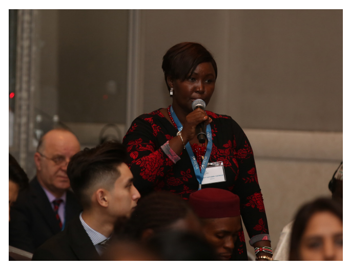
Charity Kathambi Chepkwony, Member of Parliament, Kenya

As a supplemental intervention towards the necessity of increasing the relevance of women in STEM fields, participants highlighted the importance of ensuring a better integration of social science disciplines - in which women are already dominant - in the renewable energy sector. This would increase gender empowerment and benefit also the advancement and deployment of the renewable energy sector by widening the sources of input from other disciplines. Furthermore, there is a global need to deal with social issues also in relation to the deployment of renewable energy, and technology must be combined with social sciences and finance, areas in which women already have competence, added Bärbel Höhn.