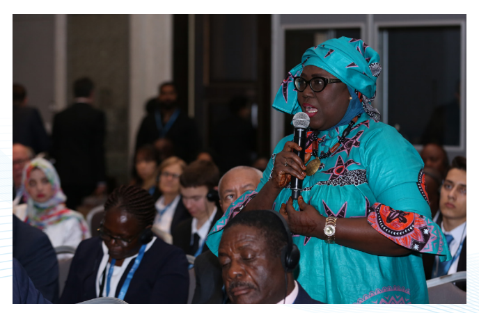
Adji Diarra Mergane, Member of Senate, Senegal

Adji Diarra Mergane, Member of Parliament of Senegal, agreed that budgetary issues still represent serious constraints on the practical implementation of laws and policies that promote the deployment of renewables in support of tackling the challenges posed by climate change.