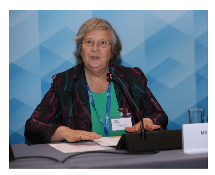
Bärbel Höhn Chair of the Global Renewables Congress and former Member of Parliament, Germany

Mrs Höhn presented the "Green People's Energy" programme of the German International Co-operation Agency (GIZ – Deutsche Gesellschaft für Internationale Zusammenarbeit), as an example promoting women's empowerment by offering special training courses provided only to women. In presenting that, Mrs Höhn pointed out the need for parliaments to start promoting laws and policies that strengthen women's participation and education in the renewable energy sector by establishing mandatory quota for women. Women's participation in the renewable energy sector can be promoted only by encouraging women to take responsibility and supporting network building among women, she added.