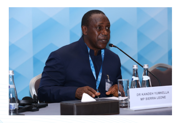
Kandeh Yumkella, Member of Parliament, Sierra Leone, and former Special Representative of the UN Secretary-General for Sustainable Energy for All

In approving laws and budgets, legislators are responsible for enhancing the speed and scale required to mitigate the effects of climate change, as well as transform global energy systems with the deployment of renewable energy, stressed Kandeh Yumkella, Member of Parliament of Sierra Leone and former Special Representative of the UN Secretary-General for Sustainable Energy for All.