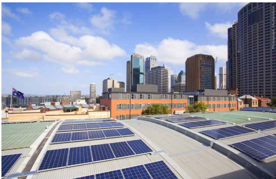
As recently as 2013, nearly 90% of the city's power came from coal

In 2013, nearly 90% of electricity consumed within city limits was generated from coal; the remaining 10% came from renewable sources. In its updated strategy, Sustainable Sydney 2030, the city plans to increase the renewable energy share to 50% by 2030 and to cover the remainder with the help of trigeneration – a technology that employs natural and recycled gas to generate electricity, heating and cooling. To reach its renewable energy goal, the City of Sydney is planning to install enough solar PV on municipality-owned properties to meet 15% of its electricity needs. It also seeks to procure additional renewable electricity through the GreenPower Scheme. As of 2018, the total installed capacity of solar PV in council sites, including office buildings, civic halls, libraries and other public spaces, had reached 800 kW and was expected to double by the end of the year (City of Sydney, 2018).