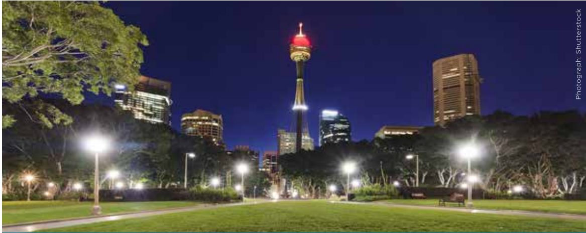
LED street lighting forms part of the Sustainable Sydney 2030 strategy