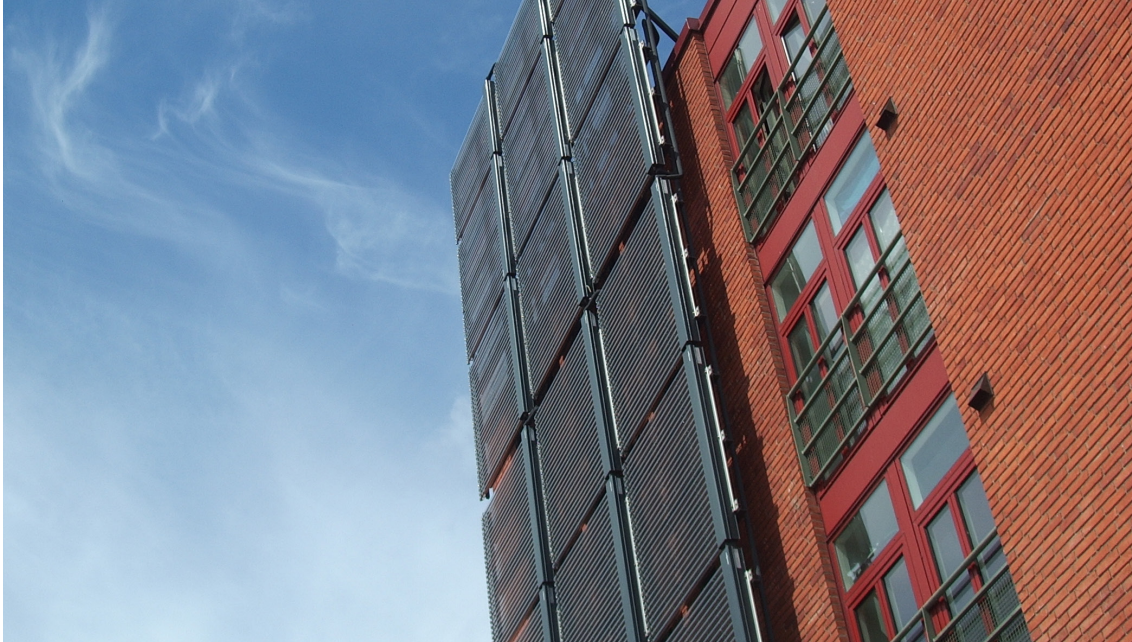
Figure 3: Tegelborgen solar collector

Among other initiatives to help the city reach its target to be climate neutral, Malmö is starting a local climate fund to compensate GHG emissions from municipal activities through increased investments in RE. Most of the projects are privately funded with large energy companies such as E.ON backing the proposals.