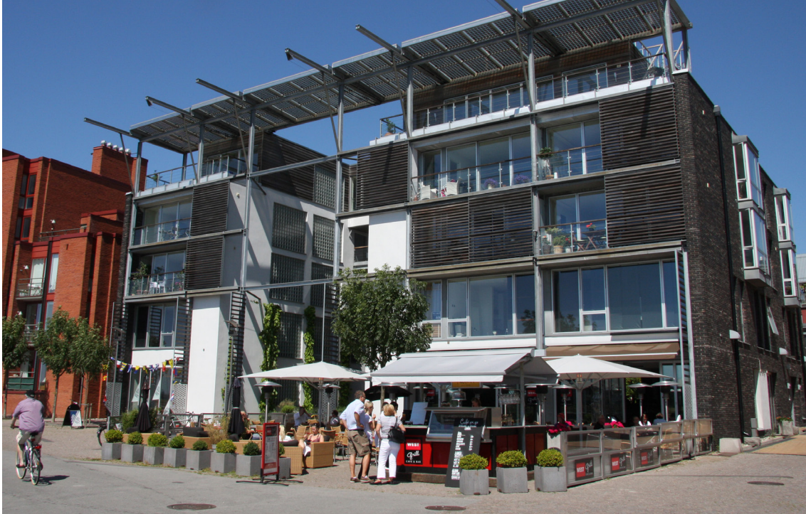
Figure 4: Photovoltaics in the Western Harbor

project, RE targets are unlikely to be met. There are also difficulties attached to such an approach, including information gathering (aggregated energy data by sector) and balancing public with private interests. Targets can be instrumental in challenging the status quo and what the private sector can deliver in an open, transparent and consultative way.