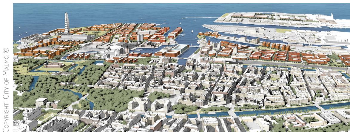
Figure 1: Malmo Vision

Local targets can set the direction of current and future action and can also support the achievement of national targets. Local governments can develop and set targets in many ways, such as integration into municipal operations, or into comprehensive city strategies and plans, or through sector-specific targets. Generally, environmental targets of local governments include reducing greenhouse gas (GHG) emissions and increasing the share of renewable energy (RE) in a city's energy mix. The city of Malmö in Sweden is a case in point. The city set targets significantly more ambitious than both the European Union's (EU) target for Sweden (49% by 2020) and the national plan (50% by 2020), such that by 2020, Malmö is expected to be climate neutral and have all municipal operations run on 100% RE by 2030. Malmö has benefited from committed local politicians, private investment in RE, strong co-operation with regional stakeholders and a thorough knowledge of the locally available RE sources. Although the implementation plan is still in its early stages, the target setting exercise has been a success in itself and has allowed the local government to integrate, synchronise and mainstream the targets across the City of Malmö's plans. Currently, the master plan is being changed to take the targets into account and work is well underway.