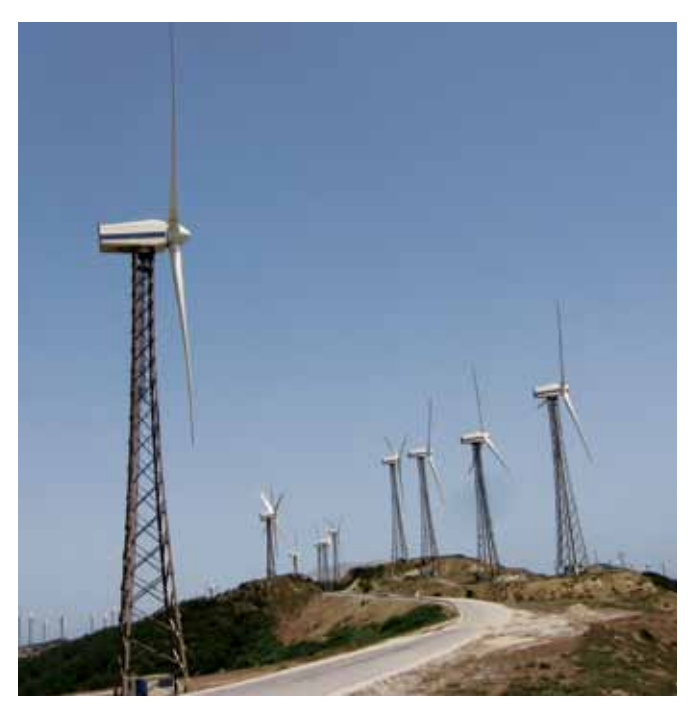
Tetouan Wind Farm, Morocco

By 2020, Portugal intends to be generating 60% of its electricity from renewable resources, in order to satisfy 31% of its final energy consumption. Grid integration will be a critical element for developing wind power. Interconnecting with the larger Spanish electricity market and the large hydropower system<sup>168</sup> enabled to integrate large amount of wind energy to the grid. However the interconnection capacity with Spain is already insufficient, since the wind regime is similar in both countries, and both countries have an overcapacity of gas and coal generation. Smart grids are now being promoted and deployed throughout Portugal as part of the National Energy Strategy. Their introduction is being combined with more efficient management of the existing networks.