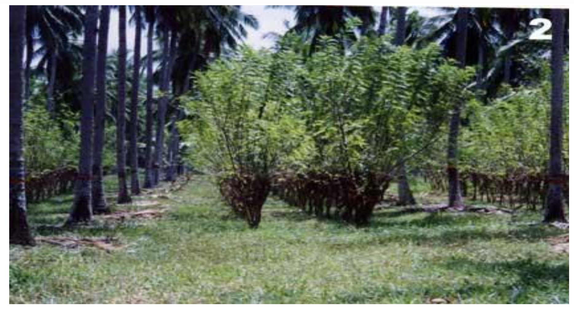
Gliricidia trees intercropped with smallholder coconut in Sri Lanka. The trees are pruned every 8 months. The wood is feedstock for electrical power generation. The foliage is used for biofertilizer and fodder for livestock on the farm.