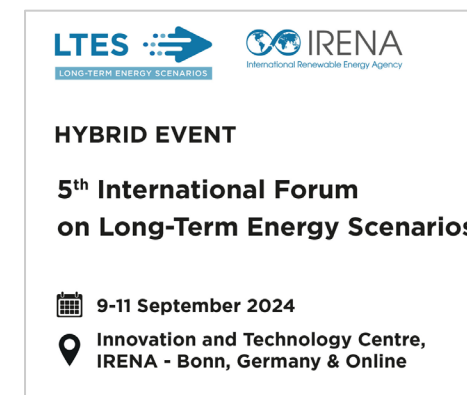
2024 LTES 5 th Forum