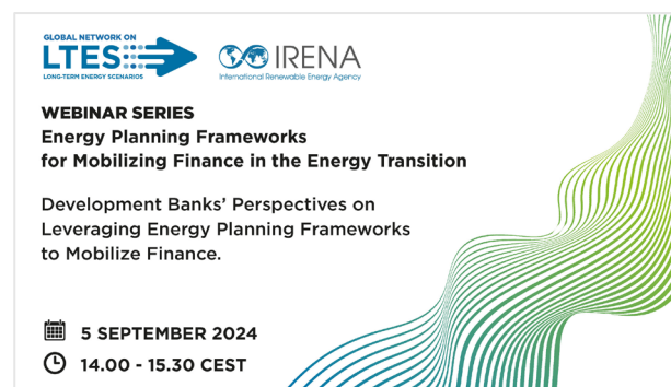
2024 LTES Webinar Series