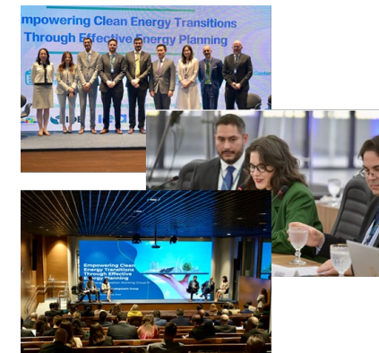
2024 Collaboration with G20 ETWG