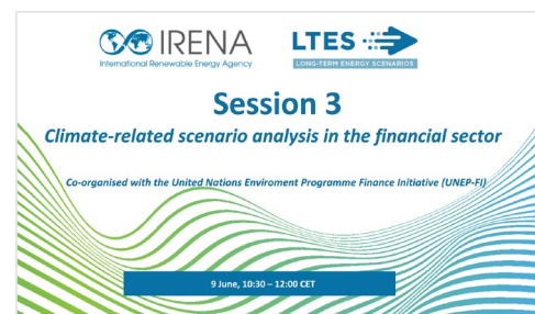
2021 LTES Forum