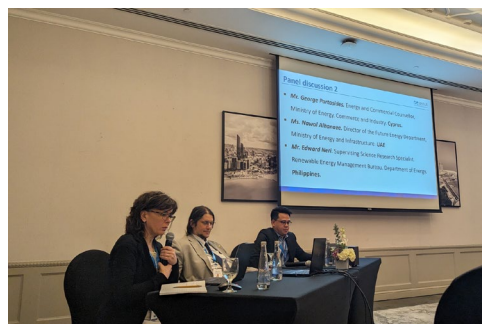
2024 IRENA Council