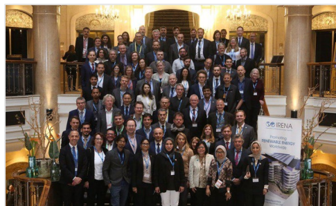
2019 LTES Forum