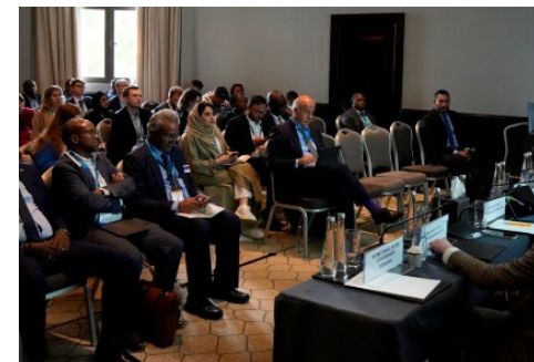
2023 IRENA Assembly